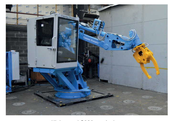
High speed C320 manipulator