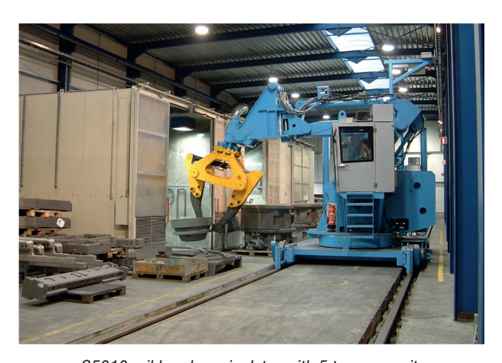
C5010 rail bond manipulator with 5 tons capacity