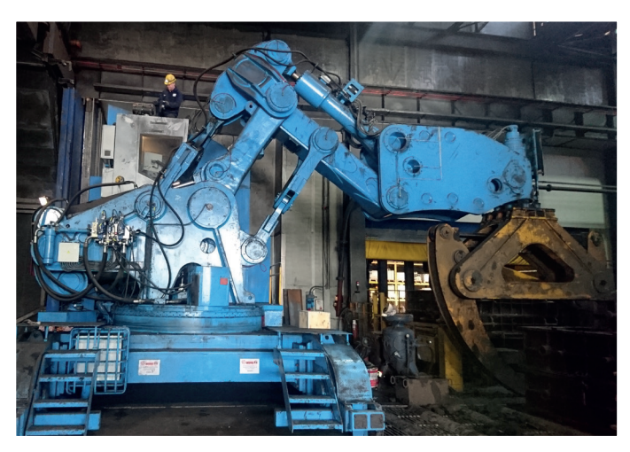
C20020 rail bound manipulator with 20 tonnes capacity