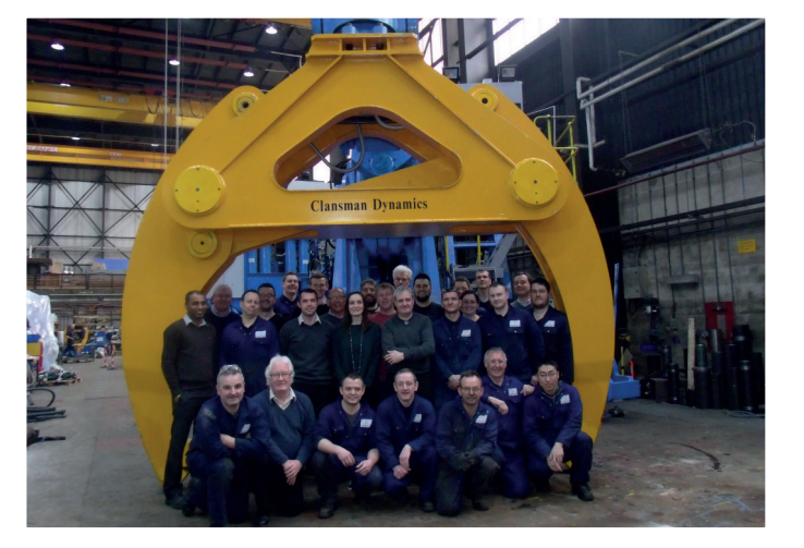
C20020 gripper up to 3.2 m – The world's largest telemanipulator