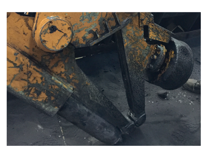
Gripper with cannon and magnet