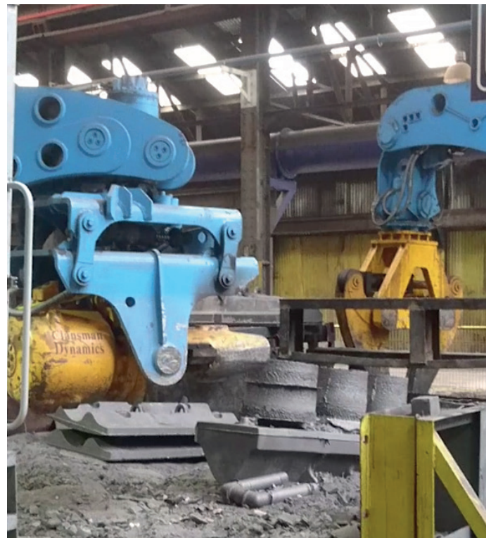
CC1000 Manipulator mounted