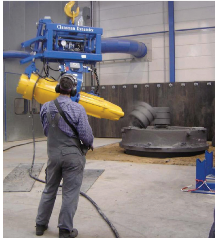
CC2000 Crane hook mounted