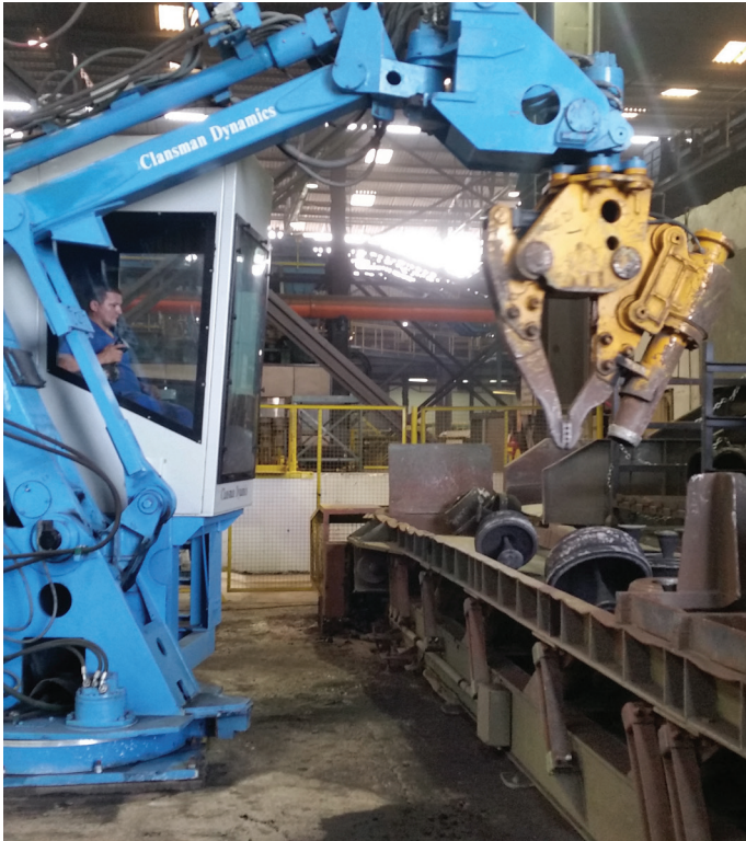
CC50 Gripper mounted