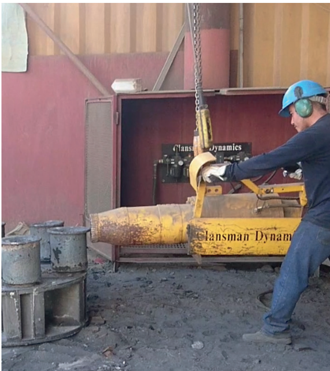
CC112 Crane hook mounted